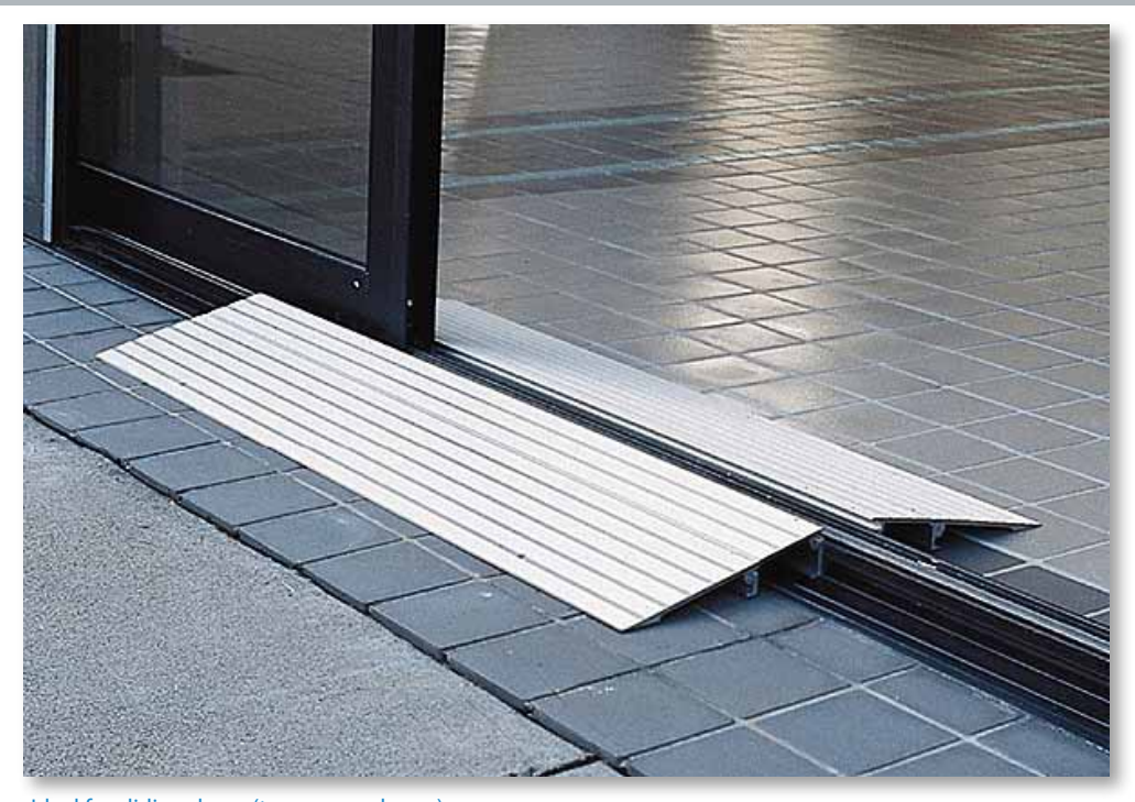
Ideal for sliding doors (two ramps shown)

The Transitions™ Modular Entry Ramp is a lightweight yet durable free-standing ramp designed for doorways, sliding glass doors, and raised landings. The modular design, with its interchangeable components, easily accommodates thresholds from 3/4″ to 6″ high.