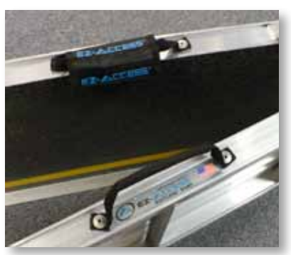
Ergonomically designed flexible, nonbreakable handles offer convenient carrying and a comfortable grip