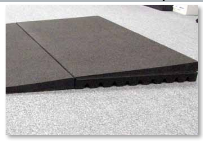
*This THR 250 is shown on top of a THR RISER 225