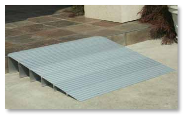
Modular design features an adjustable top flap