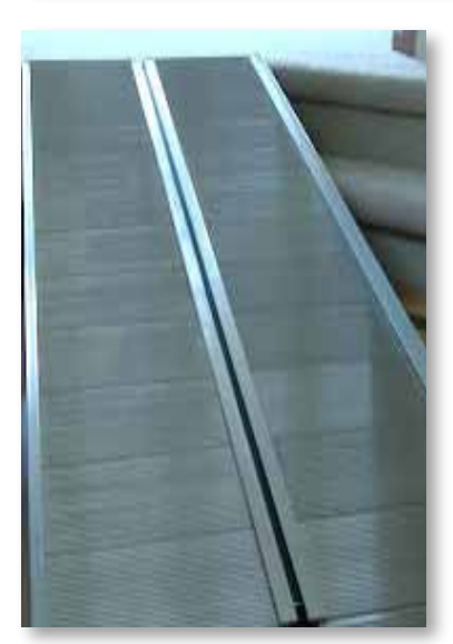
Features a no-pinch, non-protruding live hinge for safe, silent, and maintenance free operation

Available in 2′ – 8′ lengths with an 800-pound weight capacity.